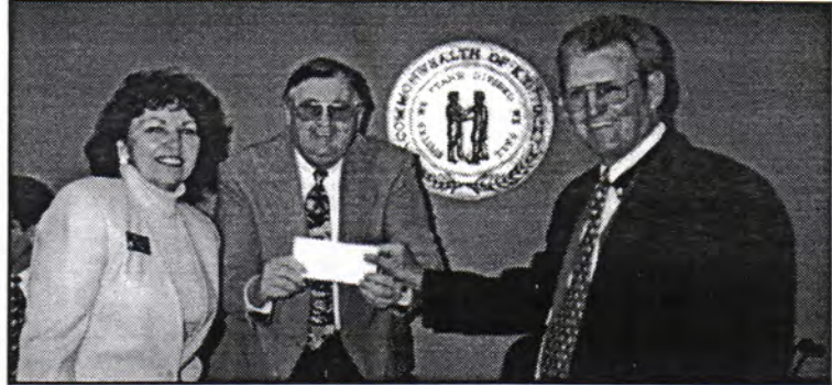
Hardin County ADF Presentation - Ambulance purchase $28,902.04 - State Senator Elizabeth Tori, Judge/Executive Glen Dalton, and State Representative Jimmie Lee.

The total FY 1998 ADF allocation of $108,593.25 was divided among the fifteen Area Development Districts on the basis of total population, and then the LTADD divided its total allocation among its eight (8) area counties.