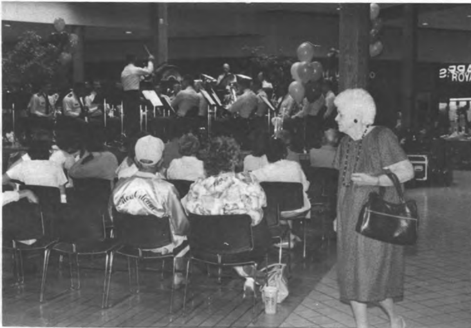
113th Army Band Fort Knox